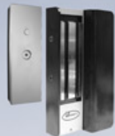
RAMSET Magnetic Lock Secures the gate(s) closed.