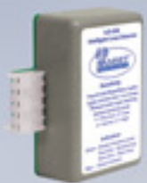
RAMSET ILD-24S Loop Detector A safety device that stops the gate from closing on a vehicle.