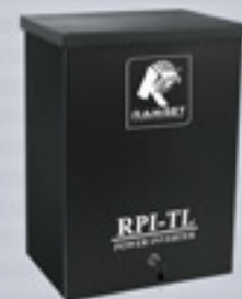
RPI (Ramset Power Inverter) Maintains power to your operator and accessories when the main power is lost. 750W output.