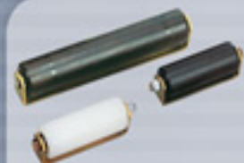
Guide Rollers Heavy duty UHMW rollers available in various lengths.