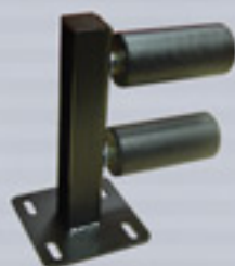
Adjustable Guide Roller Heavy duty UHMW rollers adjust to fit any gate.