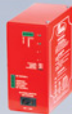
RAMSET BBS-Battery Back-Up System Opens your gate when power is lost.