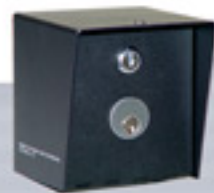
Key Switch Box Suitable for use on entry doors where access is restricted by a key.