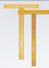
Post Mounts 1/4" angle iron flats. 3/16" square tubing legs. Used to mount the operator off the ground.