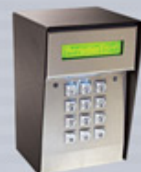
Keypad 1,024 Codes 5,112 Event Log LCD Display 7-Day Timer Time Zones Latching Stainless Steel Faceplate