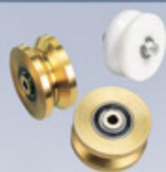
V Groove Wheels Solid steel and UHMW wheels available.