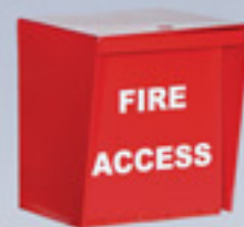
RAMSET Fire Box Allows the fire department to open your gate in the case of an emergency.