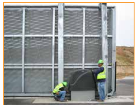
large gates up to 25,000 pounds