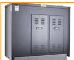
heavy-duty 10 ga steel housing option