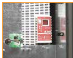
solid-state variable speed control