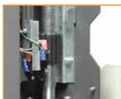
direct drive limit switches