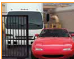
partial open open gate short distance for cars or open fully for trucks