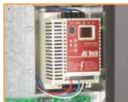
variable speed motor drive