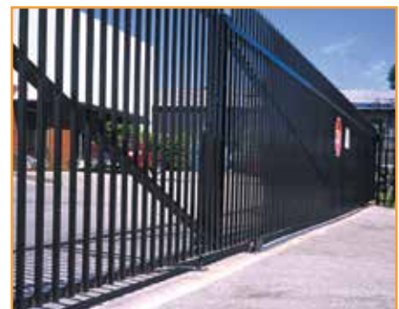
large gates up to 2000 Lbs