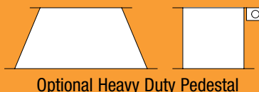
Optional Heavy Duty Pedestal

Optional Pedestal: 31.5" W x 12" H x 16.5" D (80cm W x 30.5cm H x 41.9cm D)