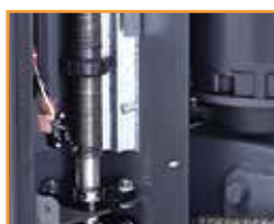
limit switches direct driven and easily adjustable